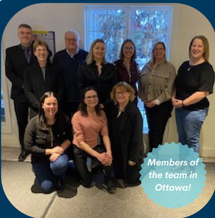
Members of the team in Ottawa!